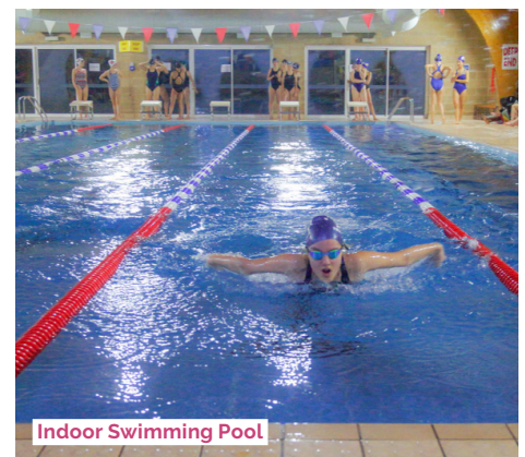
Indoor Swimming Pool